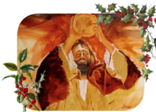
Jesus Breaking Bread